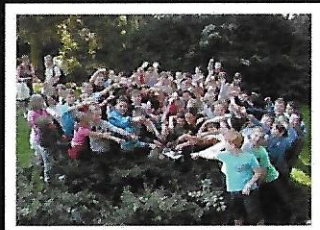
Children in Belgium with the Shoe

Sadly, all the patients pictured (on front) have succumbed to MSA. Please help us honor their memory by posing with the MSA Shoe!