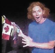
Comedian Carrot Top