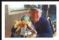
Robin Leach Celebrity Journalist

The World Famous Traveling Shoe, Representing those Suffering from Multiple System Atrophy will be coming to your area!