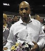
Detroit Piston Star Chauncey Billups