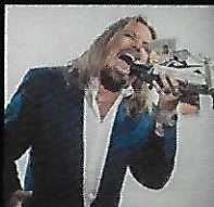
Vince Neil Mötley Crüe