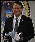
Senator Gary Peters