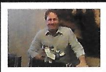
George Maloof Palms Casino Owner